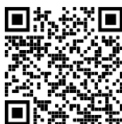
Techman - Smart automation with collaborative robots