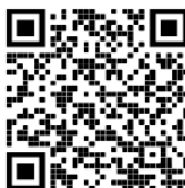
Techman Brand Story