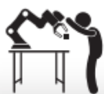
TM5 Collaborative Robot