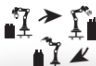
TM5 Collaborative Robot