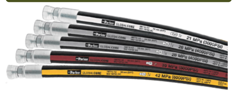
We Crimp From 0.25" up to 2.00"