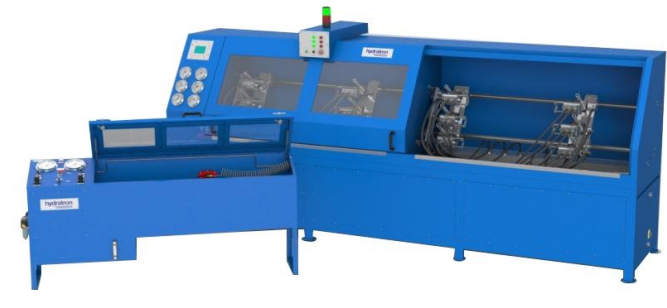
Leak Test up to 50,000 PSI