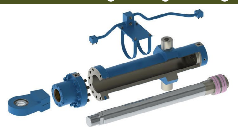
We are DD2345 Certified