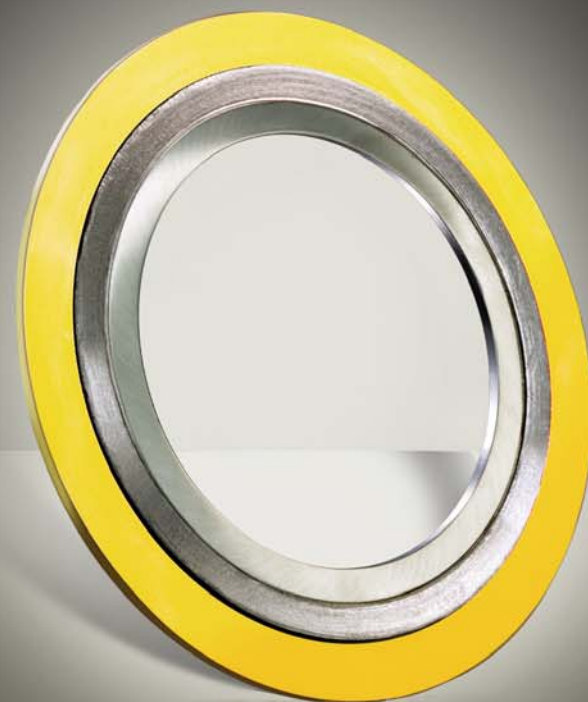
THERMICULITE® 835 Spiral Wound Filler