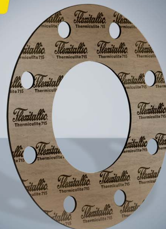
THERMICULITE® 715 Cut Gasket