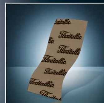
THERMICULITE® 715 Coreless Sheet

High-performance coreless sheet material. Replacement of compressed fiber sheet line, SF 2401, 2420, 3300, 5000 and tanged graphite sheet. Available in thicknesses of 1/32", 1/16", and 1/8" in cut gaskets and 60" x 60" sheet.