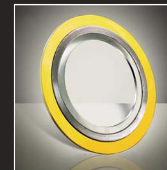
THERMICULITE® 835 Spiral Wound Filler

High temperature sheet reinforced with a 0.004" 316 stainless steel tanged core. Available in thicknesses of 1/32", 1/16", and 1/8" in meter by meter (standard) and 60" x 60" sheet. Cut gaskets also available in all shapes and sizes.