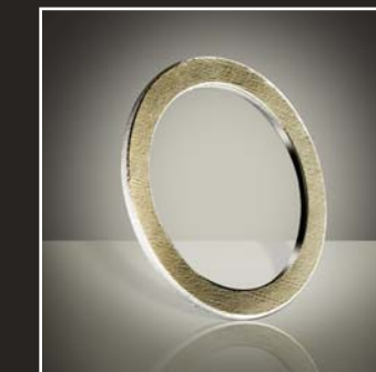
THERMICULITE® 845 Flexpro™ (kammprofile) Facing

High temperature filler material for spiral wound gaskets. Wide range of metals available.