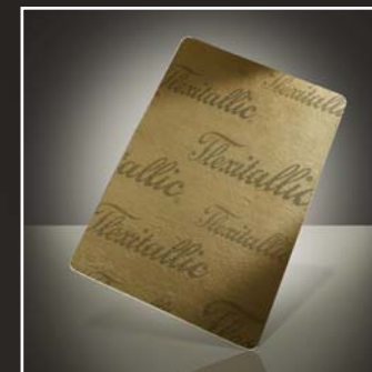
THERMICULITE® 815 Tanged Sheet

High temperature sheet reinforced with a 0.004" 316 stainless steel tanged core. Available in thicknesses of 1/32", 1/16", and 1/8" in meter by meter (standard) and 60" x 60" sheet. Cut gaskets also available in all shapes and sizes.